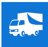
Transportation & Logistic

Oodles' Expertise comprises of explicit experience in almost every industry. We aspire to use emerging cutting-edge technologies such as IOT, Blockchain, AR/VR, Big-Data to revitalize the business operation in various spectrum of industries.